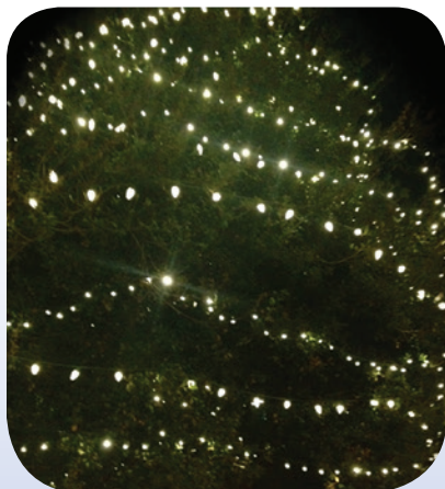
Honoring our loved ones at the Tree of Lights

Safeway Foundation Salinas Valley Memorial Hospital Foundation Sharanam Foundation Silicon Valley Bank Foundation Silicon Valley Community Foundation Stolp Family Foundation Surf City/Santa Cruz Kiwanis Foundation The Progressive Insurance Foundation Touchpoint Foundation Watsonville Rotary Foundation Wells Fargo Foundation