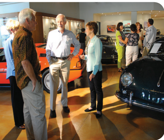
Angels appreciation event at Canepa

Due to space limitations, gifts made to HSCC between July 1, 2013, and November 30, 2014, in the amount of $250 and above are listed. We remain grateful for all who made a gift of support of any amount. Every effort has been made to ensure the accuracy of the names listed. Please accept our apologies for any errors or admissions and call us at 430-3000 with any corrections.