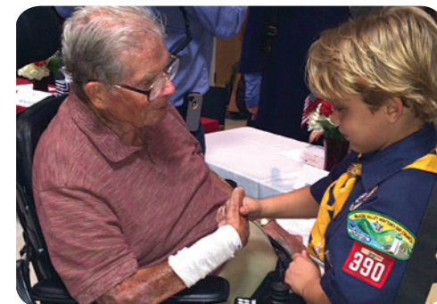
Honoring our veterans