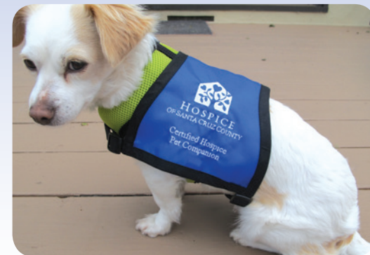
Dolly is ready to serve