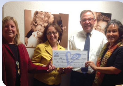
System Studies present a generous donation