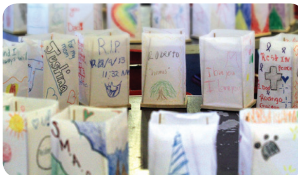
Luminarias made by campers to honor their loved ones