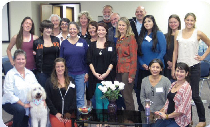
2014 Volunteer Visitor training graduates