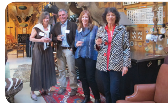
Enjoying a special evening at the Lester Ranch