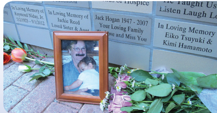
We remember ... Redwood Grove Memorial Wall