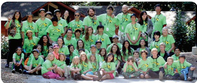
Our 2014 Camp Erin campers