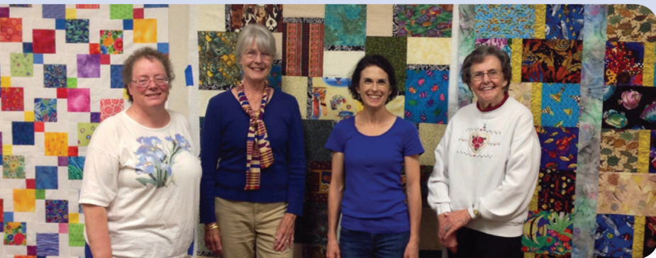
Pajaro Valley Quilters display quilts for Camp Erin kids