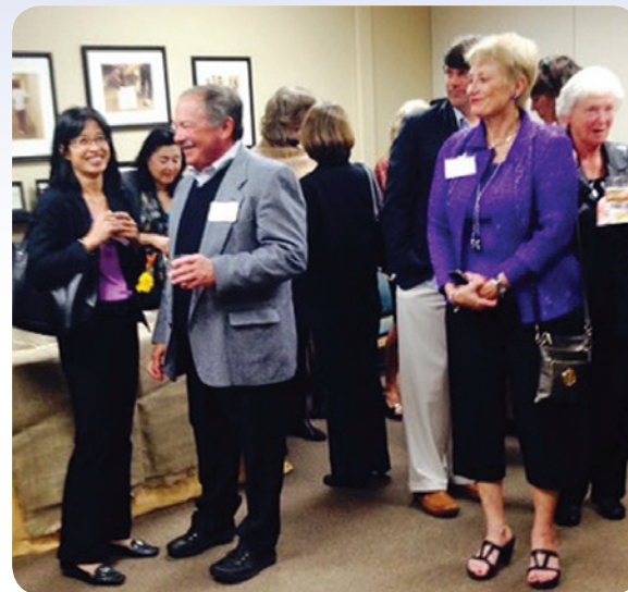
Guests celebrate at the Borina Family Center