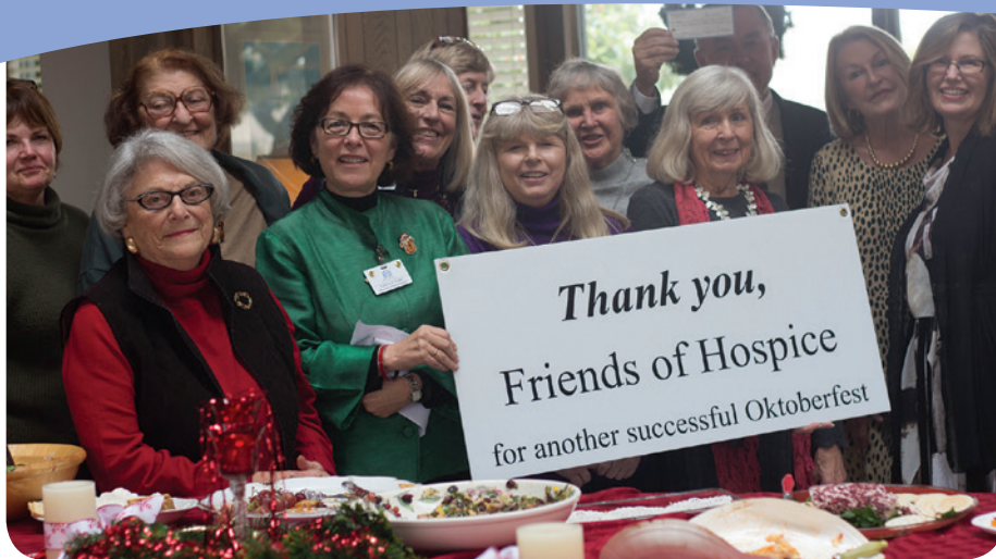
Celebrating their success